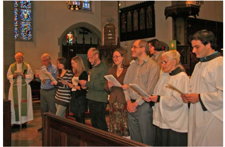
The Rector welcomes new members at the 10:30 worship service on November 13.

Haiti. Our parish continues to support the rebuilding of Haiti after the earthquake that devastated the country in January 2010. The needs in Haiti are great. You can donate to Partners in Health at https://donate.pih.org/page/contribute/haiti_earthquake ; to Episcopal Relief and Development at https://www.er-d.org/donate-select.php ; Oxfam America at www.oxfamamerica.org ; and to the Sisters of St. Margaret at http://www.smbos.com/Pages/Haiti.html .